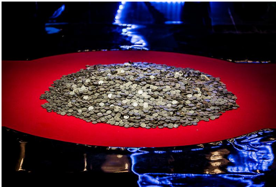
Picture 18 A picture of the pile of £1 pound coins which was used as a prop in the play.

stage”. Ellinson describes this shift in perception as happening really fast, and she adds that she was surprised not only by the audience’s reaction at the view of real money, but also by her own feeling of excitement in that moment. She reports to have been impressed by the fact that “the function of money on stage had so much meaning and no meaning at the same time” 83 . Therefore, the audience at the same time gets involved in the games that follow in the show because the possibility to handle a huge quantity of money leads to a feeling of excitement but, as the story goes on, they also become more aware of the arbitrary value of money.