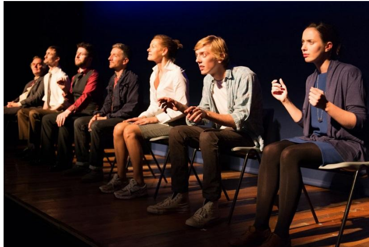
Picture 10 The narrators recounting Gorge's story in the first act.