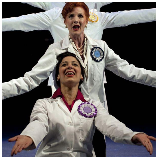
Picture 6 The barber shop quartet of Analysts.

Analysts ( singing ) ENRON, ENRON, ENRON, ENRON. If your company bank accounts need filling! He's available and willing. To see to it that you make a killing! Skilling, Skilling, Skilling, Skilling, Skilling, Be boo doo wop wop ba doo!