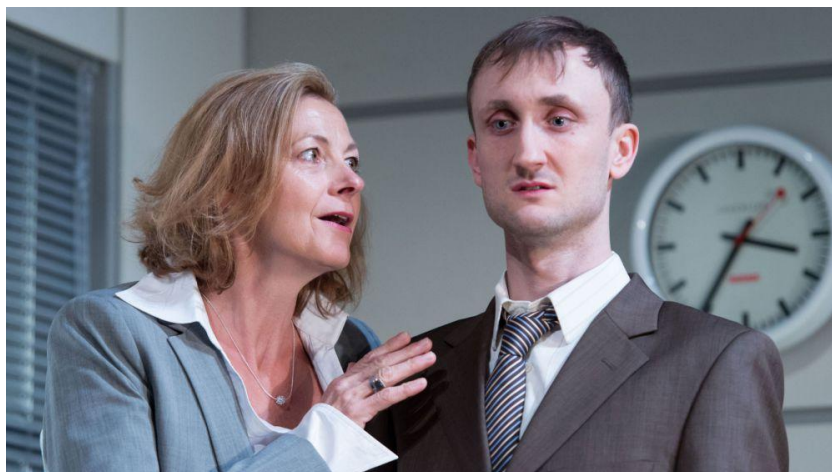
Picture 11 A (on the left) makes her speech to Gorge Mastromas (on the right). The clock on the wall is a telling detail.

Another interesting aspect highlighted in A's words is that she is convinced to be so powerful that she can even control time and predict the future. The ability of controlling time seems to be a particularly interesting metaphor to represent power. Clock ticking sounds and digital clocks were also used in the performance setting to further expand this metaphor throughout the play.