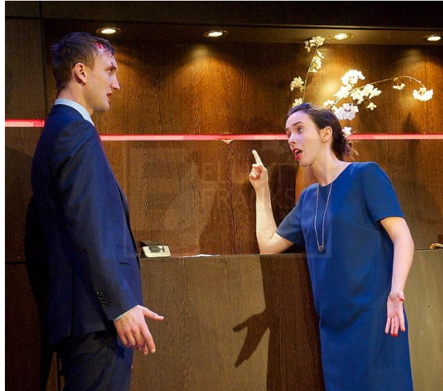
Picture 12 The scene in which Gorge deceived Louisa. Act three.

From this scene on, the protagonist’s ability to lie expands to an extreme extent. Significantly, one of the narrators’ comment at this point seems to outline the play’s most important themes quite straightforwardly.