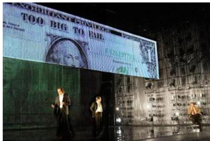
Picture 1 The projection of a banknote with the writing 'Too Big to Fail' on screen.

Moreover, floating numbers in a trading floor-style font appear on the screen after Scene One and in Scene 9. This visual content – which could be considered a mere decoration – thus opens and closes the story recounted in the play. There is only an epilogue afterwards, which hosts a conversation between David Hare and George Soros. As regards light design and sound effects, The Power of Yes does not present a particularly telling framework. Diffuse lights are used in every scene together with spotlights on certain characters. The lighting designer Paul Constable chose soft blue lights to signal the transition between the scenes. In terms of music, simple tunes played on a marimba by Frank Ricotti serve again to signal the passage from a scene to another. Therefore, although the play's setting seems to be quite plain, the few elements which were introduced appear to have been accurately chosen to facilitate the audience's reception of the show.