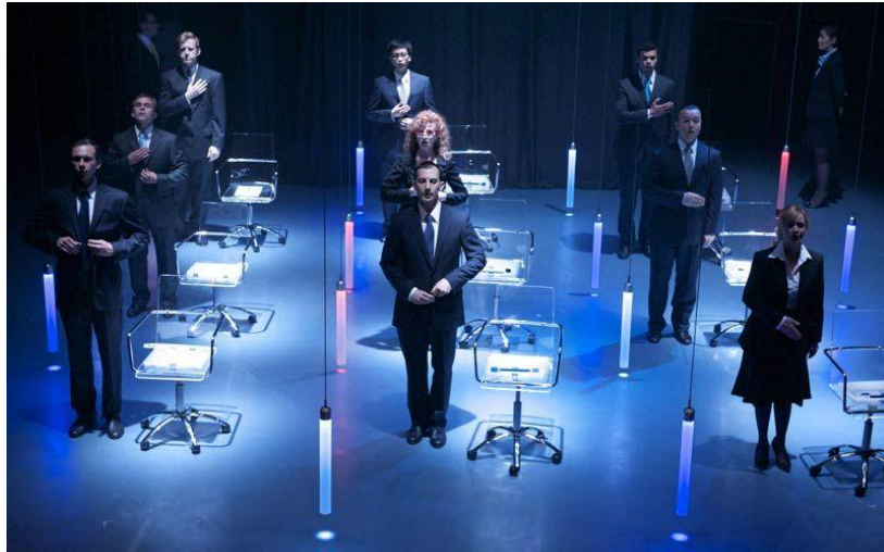
Picture 5 The first choreography in the play. Employees dance and sing the national anthem.