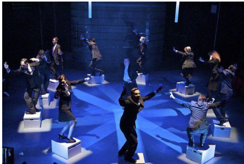
Picture 7 A dance representing the company's employees at work.

specific narrative turns in the play. There are various choreographies, which apparently have this function. A symmetrically arranged dance on the USA national anthem starring Enron's employees opens Act I and leads the audience in the place where the play is set. A long dancing sequence was used in Act I Scene 4 to depict most significantly the metamorphosis of Enron into a trading center. The performance starts with a harmonious music and a matching choreography symbolizing the commodities traded by the renovated company. Then, characters dance and move objects around while the picture of a huge glass building appears on the screen. Right afterwards, while white and green financial figures are projected onto them, employees engage in an energetic choreography representing the action of trading. The characters' dance moves are interestingly accompanied by the typical gestures used by traders to communicate – technically called 'arbing' 40 . The caption below captured a similar dance in Act I Scene 6, which shows the company at work.