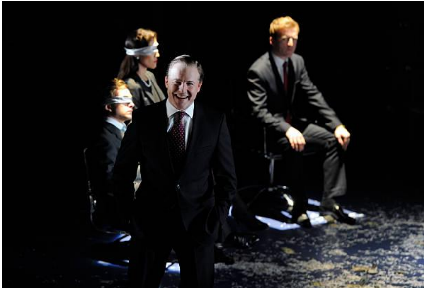
Picture 9 Jeffrey Skilling after his transformation. Andy Fastow in the background.

Returning now to the metamorphosis that Skilling undergoes as the story goes on, this character outward transformation seems to emphasise the exponential growth of his thirst for money and power, and in more metaphorical terms his hubris. The next section will explore in detail how Skilling's rise and fall have been represented in the play.